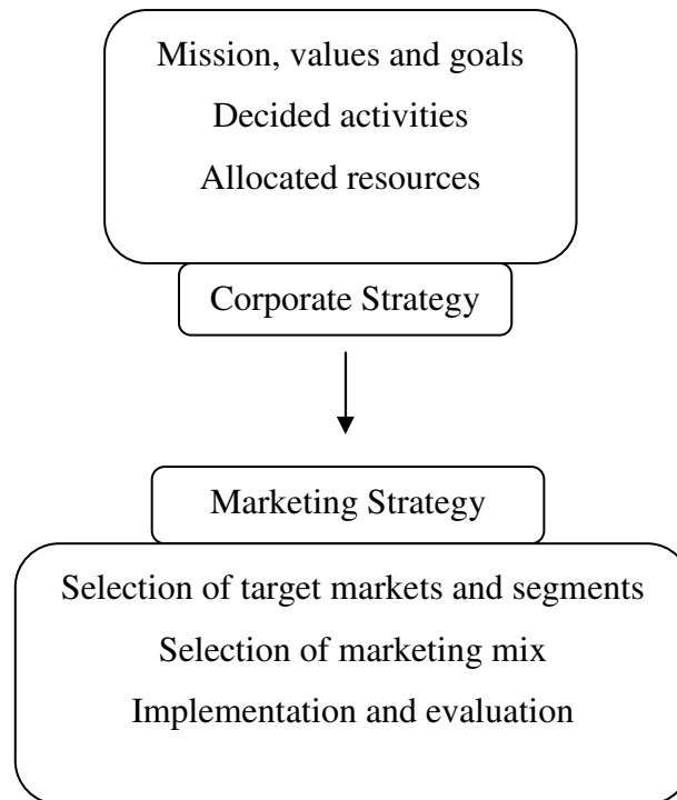
Figure 1. The Relationship Between Corporate and Marketing Strategies (Baines et al. 2008, 180; Simplified version, completed by the author of the thesis)